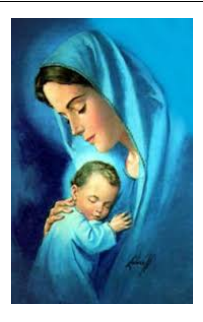
Holy Mary, Mother of God pray for us!